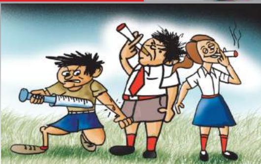
CHILDREN INVOLVED IN SUBSTANCE ABUSE