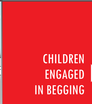
CHILDREN ENGAGED IN BEGGING