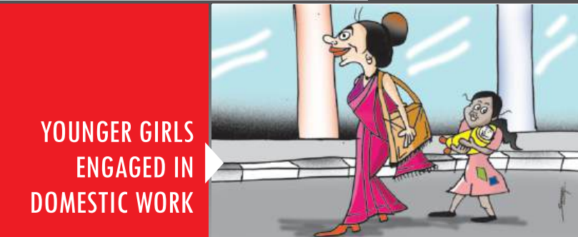
YOUNGER GIRLS ENGAGED IN DOMESTIC WORK