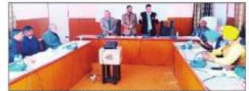
A training programme in progress at Nowshera.

Representative from Block health, Mission Poshan, Lambardar, Children repre-