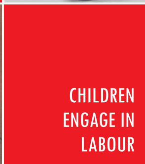
CHILDREN ENGAGE IN LABOUR